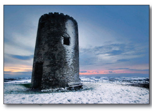
A wintry dawn on Windmill Hill in Portaferry