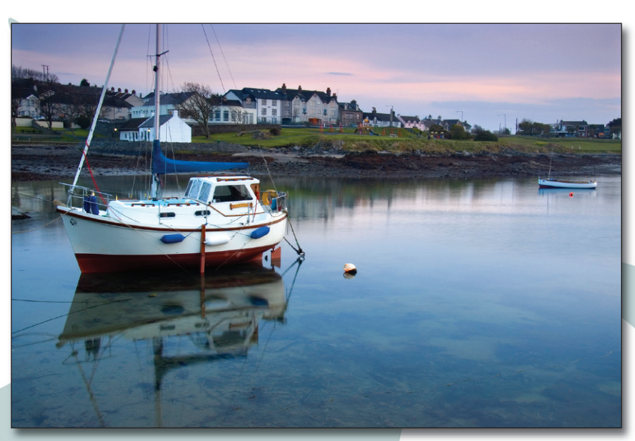
Groomsport Harbour at dusk