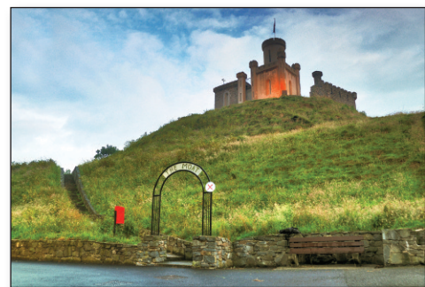
The Moat Castle in Donaghadee